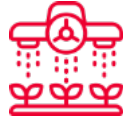
CHEMICAL & FERTILIZERS