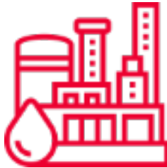
REFINERIES & PETROCHEMICALS