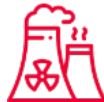
NUCLEAR & THERMAL