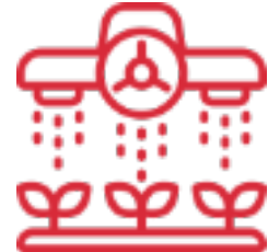
CHEMICAL & FERTILIZERS